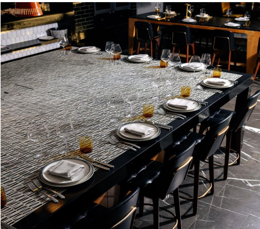
The Cube Table