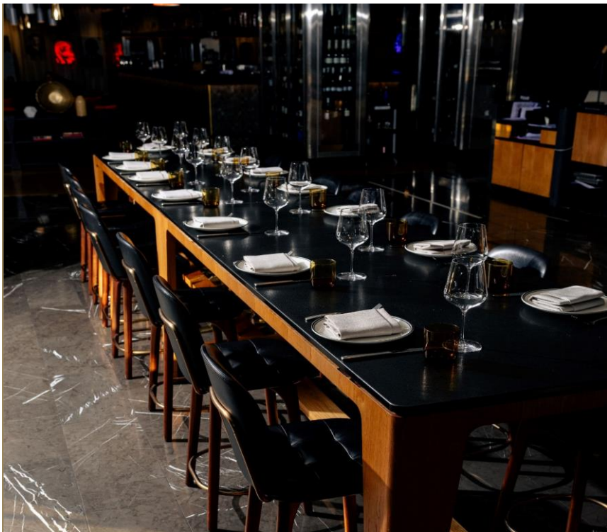
The Longest Table