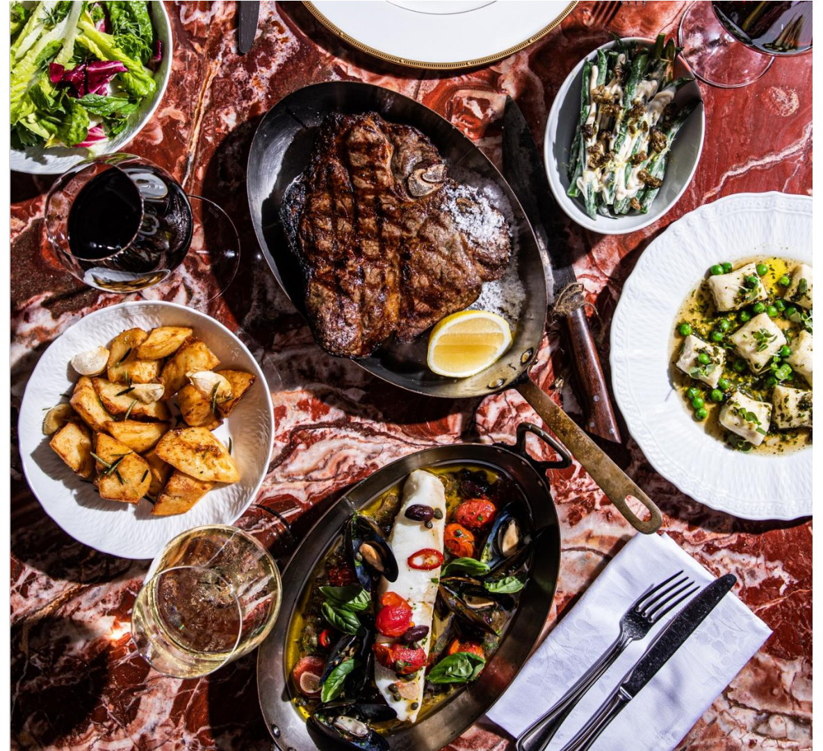
A standard 10% service fee applies to all bookings with the exception of Day Delegate Packages